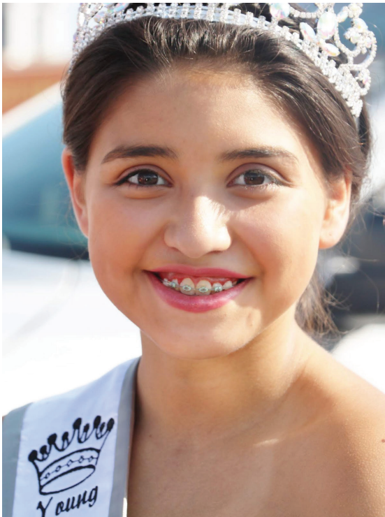
The much younger generation gathered with family and friends at the Leon Valley 4th of July Parade. Elementary students raced as fast as 30 mph in the new soap box derby. American legion commanders were celebrated by all.