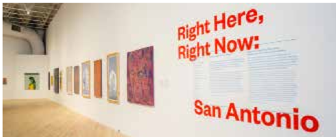
Installation view, Right Here, Right Now: San Antonio.