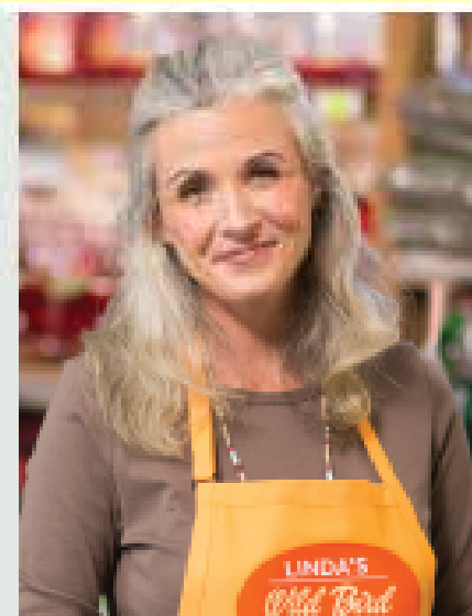
www.edwardjones.com Member SIPC

1344 S Flores St Suite 205 San Antonio, TX 78205 210-354-4915