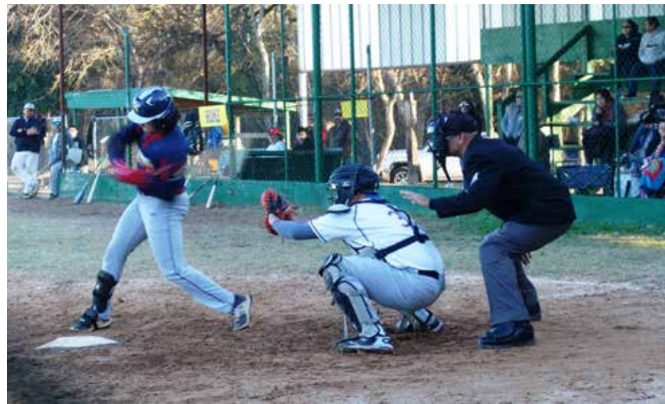
Acción en el partido que Bravos derrotó a Rieleros