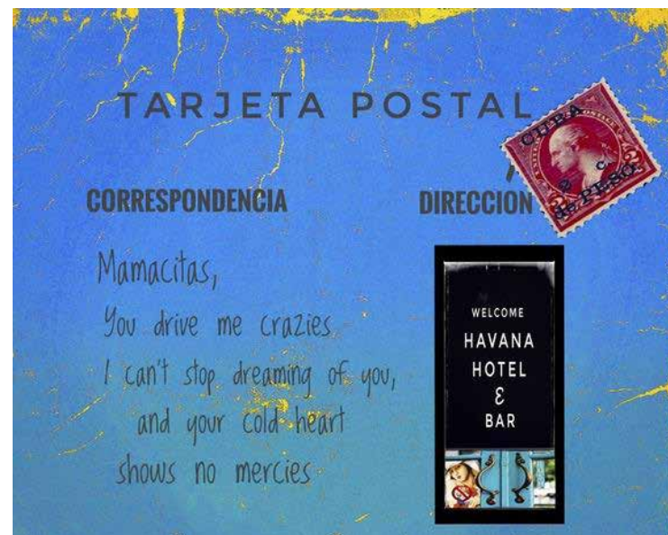
"Havana Nocturne" 25'x23'

Framed Photographic Print Courtesy of AnArte Gallery