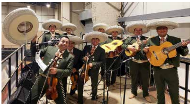
February 2019 at San Antonio Stock Show and Rodeo