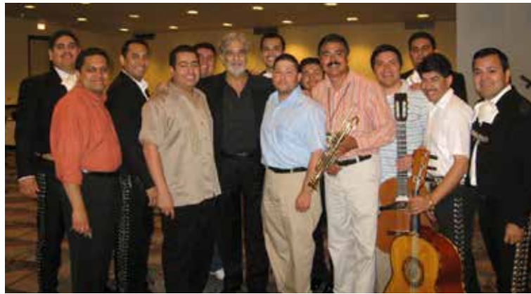
With Placido Domingo, 2007

This level of professionalism paid off with the release of their self-titled first album in 2007, which they gave to “our friends and whoever would listen, before Spotify, ten-eleven years ago to have that. There was a friend of ours who somehow gave it to one of the producers that was bringing in Placido Domingo,” which garnered attention and helped the band audition and be selected to play with world-renowned international opera tenor Placido Domingo at the Alamodome in 2007 and the AT&T Center in 2010, accompanied by the San Antonio Symphony. The Domingo