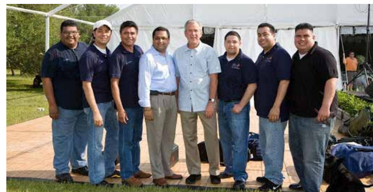
With President George W. Bush, 2008