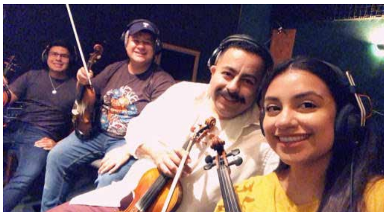
In the recording studio