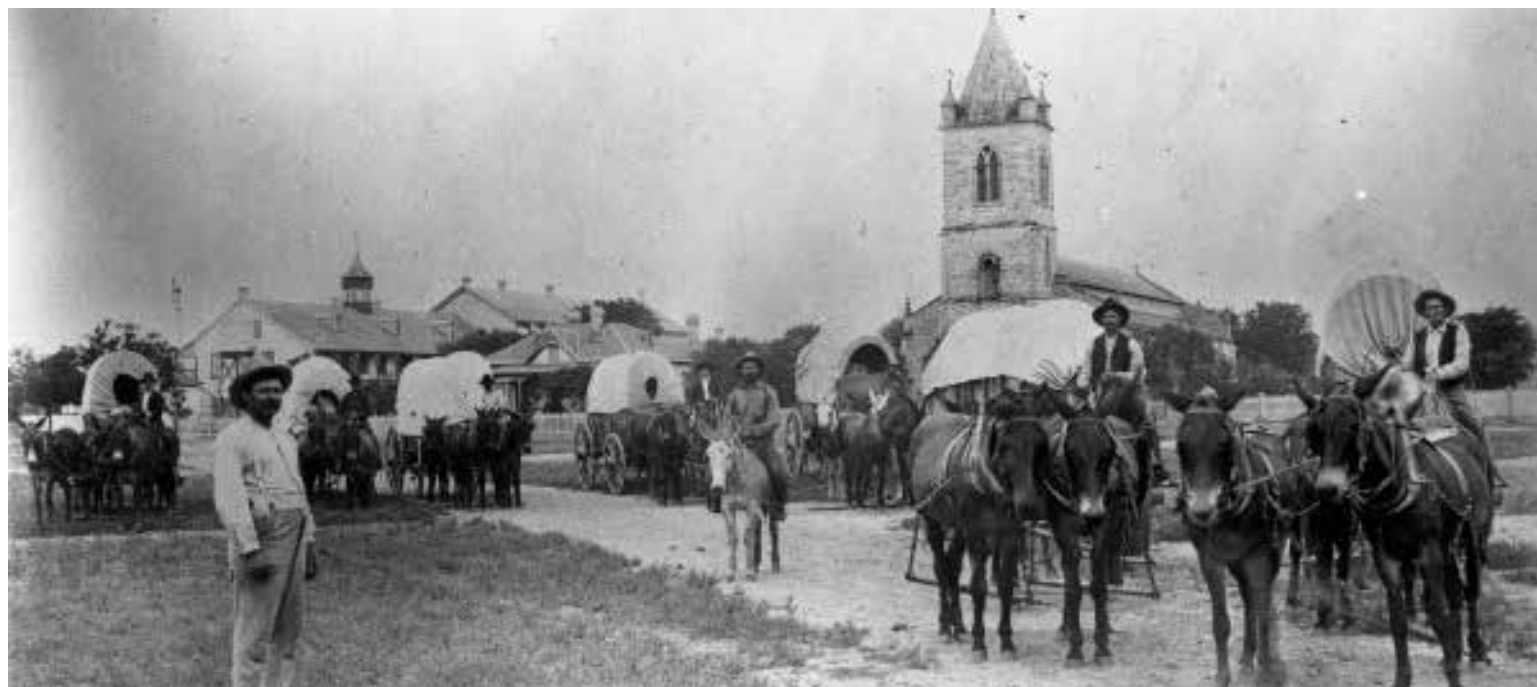
Wagon train pauses on Houston Square, circa 1900. (MS 362: 096-0537)

The population was 2,680 at the 2010 census. Prior to 1893, Castroville was the first county seat of Medina County. Castroville is part of the San Antonio Metropolitan Statistical Area.