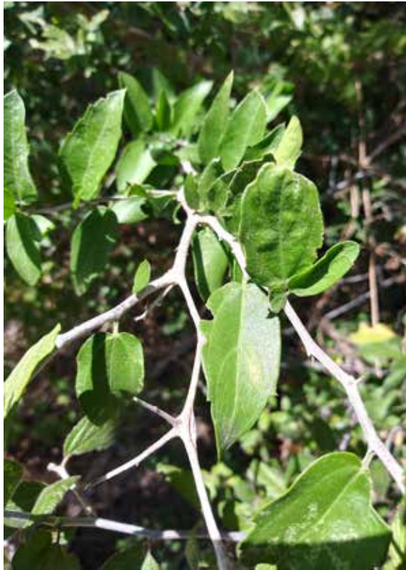
Celtis ehrenbergiana mantiene sus hojas verdes durante gran parte del año. Durante la caída de la hoja, las espinas son visibles a lo largo de la corteza gris lisa de las ramas.