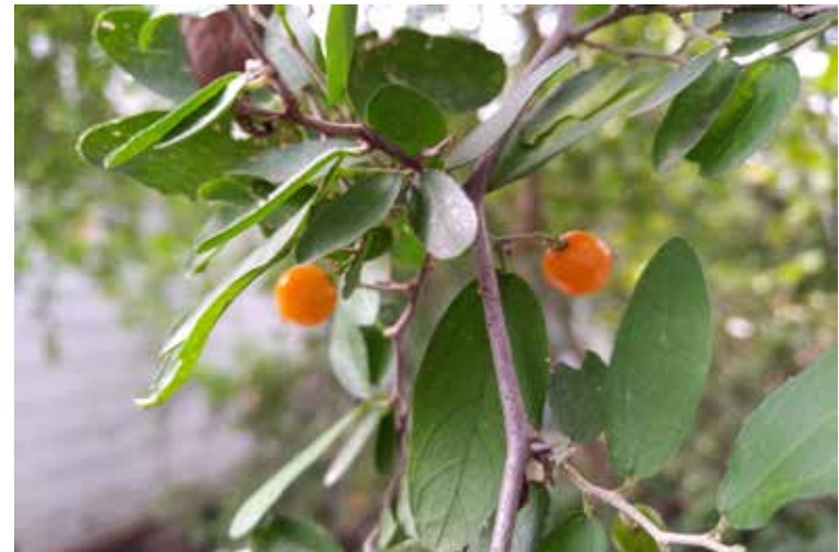
Celtis ehrenbergiana forma un sotobosque con Agarita, Coma, Brasil; debajo de olmo, enebro, mezquite, caqui de Texas, entre Salado Creek y Pecan Valley Lake en Southside Lions Park. El árbol respondió a la desaparición en el derecho de paso de la carretera mantenida extendiéndose en lo alto del matorral circundante; creando una fuerte protección para la vida silvestre.