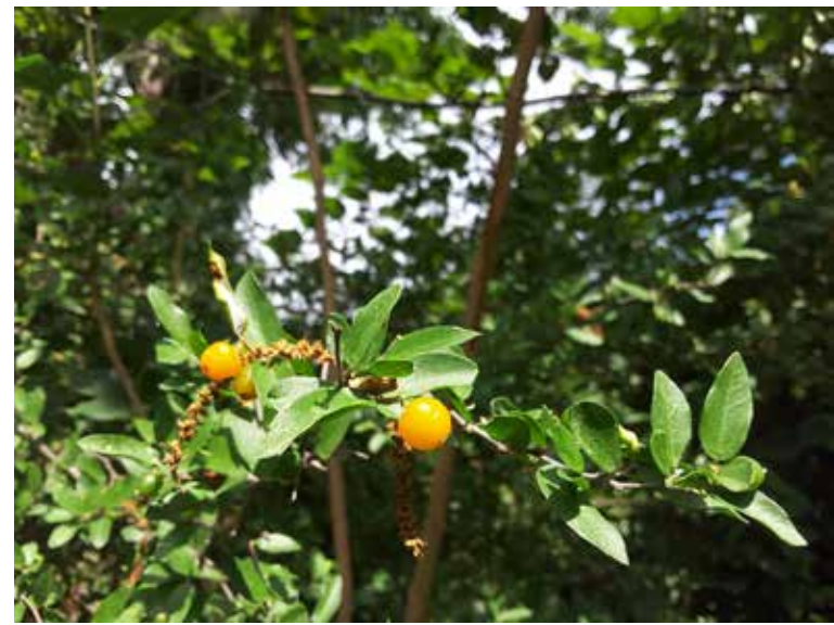
Las frutas Celtis ehrenbergiana aparecen durante todo el verano, al alcance de humanos y pájaros; pero los picos en las ramas disuaden a los mamíferos de cosechar fruta antes de que caiga al suelo.