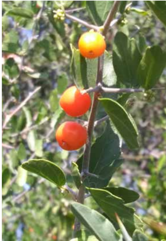
El sabor de la fruta Celtis ehrenbergiana a menudo se compara con el del melón.