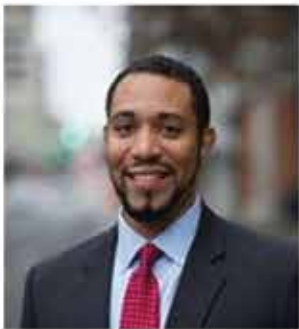
Commissioner Tommy Calvert