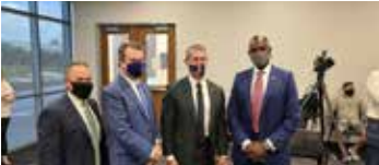
By Bonnie Berkley P17

City Collaboration to Fight Childhood Hunger and Obesity Exacerbated by COVID-19 in Underserved Communities