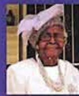
DOROTHY MONDINE COLISEUM OAKS