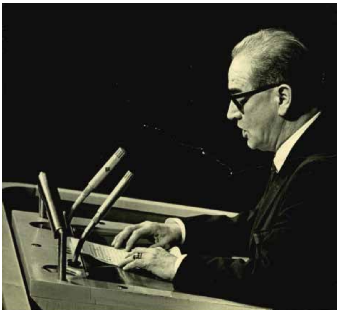
Dr. Hector P. Garcia, U.S. Ambassador to the U.N.

gress passed legislation to reward those who had fought to defend American democracy and freedom. With G.I. Bill benefits veterans could count on medical care, burial rights, housing assistance, and free college tuition.