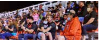
Por Franco P5

SAFC doblegó 2-1 al Birmingham Legión FC durante Viva Night presentada por H-E-B