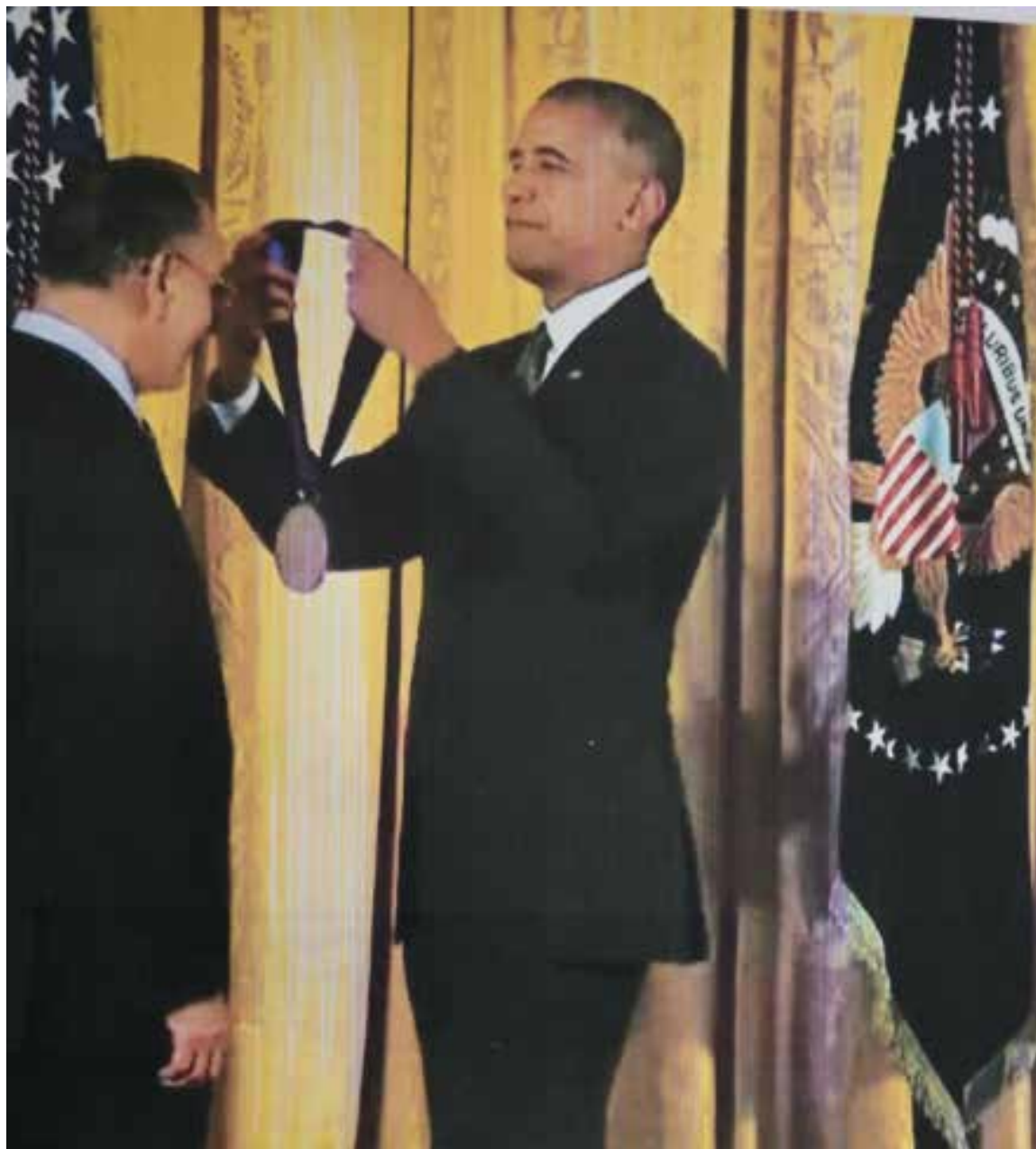
Jimenez, Jr. receiving the National Medal of Arts from President Barack Obama.