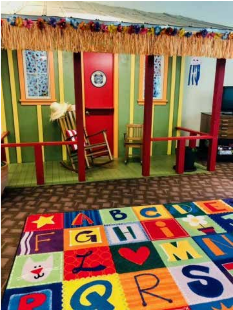
Children’s section, El Progreso Memorial Library.