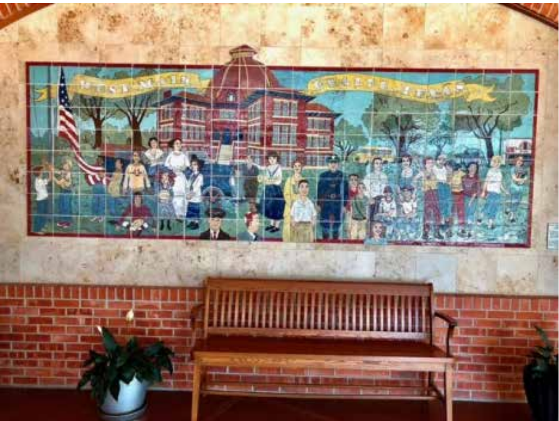
Historical Tile Mural. Children’s Section, El Progreso Memorial Library.