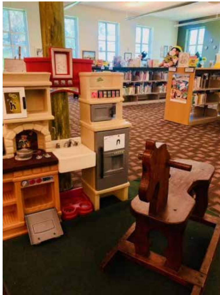
Children's section, El Progreso Memorial Library.

Founded in 1903, Uvalde's El Progreso Memorial Library is one of the more important public institutions in the city. The library is free to the public and had 22,658 cardholders in 2021. In addition, the Progreso Library's public space of 36,00 square feet serves as a cultural and civic center for Uvalde and surrounding communities. The library offers a gathering place for research, meetings, networking, self-improvement, and communication. Over the past year,