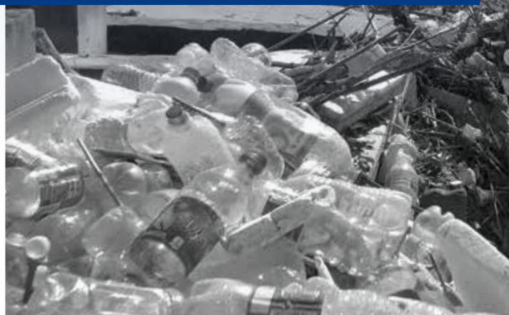
Imagen real del río San Antonio después de una tormenta.

Cuando llueve, la basura de las calles, los estacionamientos y los vecindarios termina en zanjas y alcantarillas pluviales, que drenan a los arroyos y ríos de la zona. Esto hace que los parques se vean desagradables y daña los hábitats de la vida silvestre. Cuida tu río. Pon la basura en su lugar.