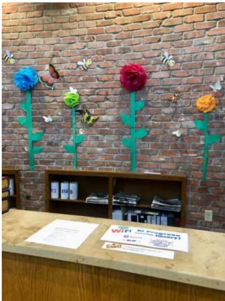
Children's section, El Progreso Memorial Library.