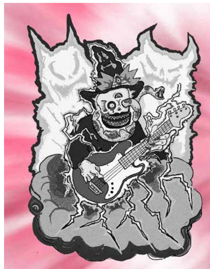
New Cassette Tape 'Hotter 'n Hell'