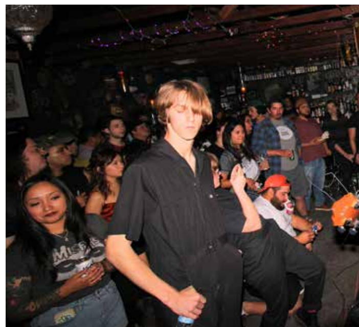
The Wizard LIVE at Faust

The 'Hotter 'n Hell' cassette, released through a collaboration between Fuzzy Cat Records and Out With The Goons Records, features cover art by local San Antonio painter Mauro de la Tierra with finely hand-crafted fold-out inserts by the OWTG team, utilizing live show photography shot by Death to Content.