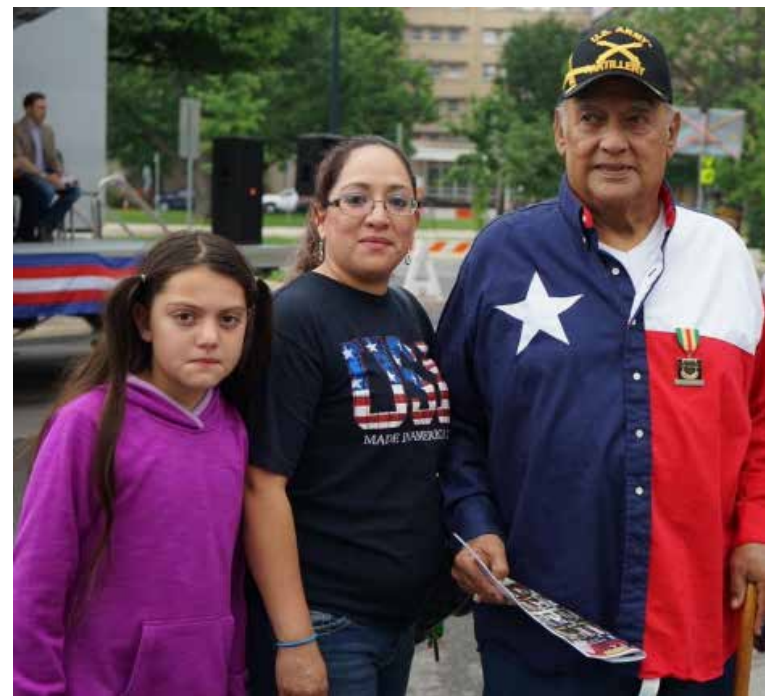
Political participation among Latinos across all generations will be essential in the upcoming 2022 elections.