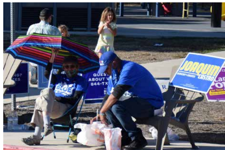
Congressman Joaquin Castro was re-elected by wide margins in San Antonio, Texas.

Latinos have managed to elect state and federal officials in Southwestern states with sizeable Hispanic populations, such as California [39.4% Hispanic], Arizona [30.7% Hispanic], Nevada [28.7% Hispanic], and New Mexico [47.7% Hispanic]. In states where Latinos are also a majority or near a majority, such as California, Nevada, and New Mexico, each has Latino Democrats in the U.S. Senate. Texas has Senator Ted Cruz, of Cuban descent, who does not identify with Latinos in his adopted state and has yet to propose any legislation