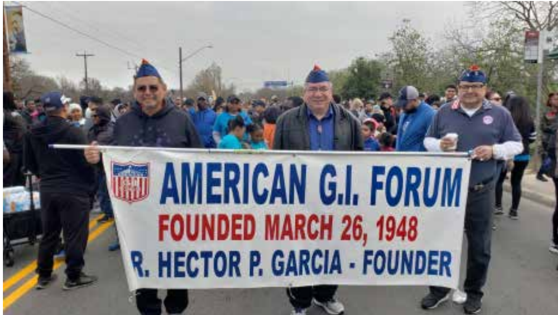
The American G.I. Forum and the League of Latin American Citizens [LULAC] were instrumental in the first voter registration drives in Texas.