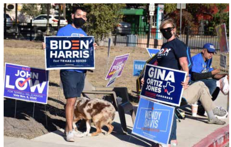
Biden-Harris supporters were prominent on election day across the state of Texas in the 2020 election.

that would assist Latinos. Moreover, Cruz has sided with state Republican leaders who passed legislation to suppress the votes of