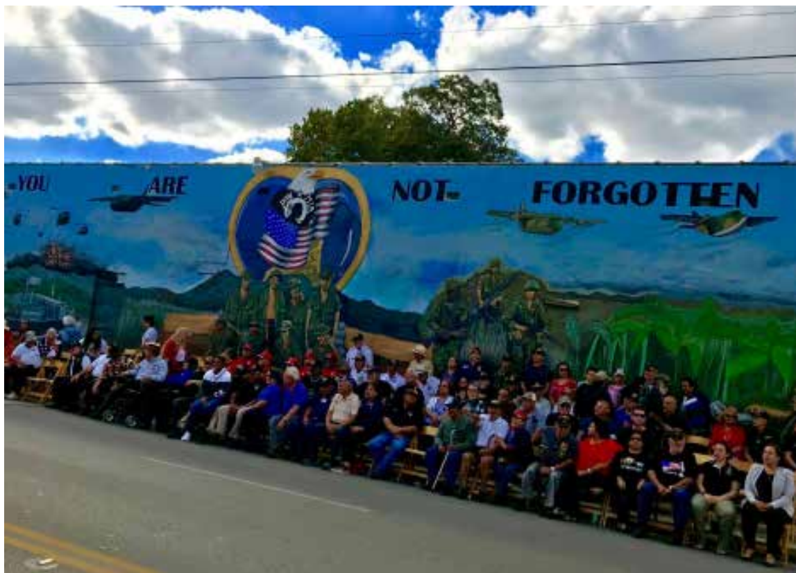
Latinos in San Antonio's Westside attend a political rally. [Michael Roman Mural]

$54,857. Policy experts predict that poverty will persist until state policymakers employ more effective tools to combat this income disparity. Many Hispanics believe that the current Texas Republican government is insensitive to their plight. As a consequence, Latinos are mounting a get-out-the-vote campaign to elect Latinos to state-wide offices. Currently, no Latinos hold state-wide offices in Texas.