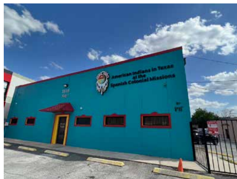
The new AITSCM offices on 1616 East Commerce St.

for transportation, exploration, and warfare. In much of South Texas the mission Indians were among the first “cowboys” or vaqueros. The mission Indians were excellent horsemen and were needed to round up cattle and wild horses. Over time, San Antonio grew as more mestizos—those of Mexican and Indian heritage—moved from the Mexican interior states. Thus, it can be argued that the mission Indians, who made up the majority of San Antonio’s population, were the first true cowboys of the West.