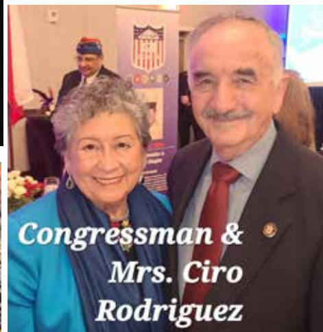
Congressman & Mrs. Ciro Rodriguez