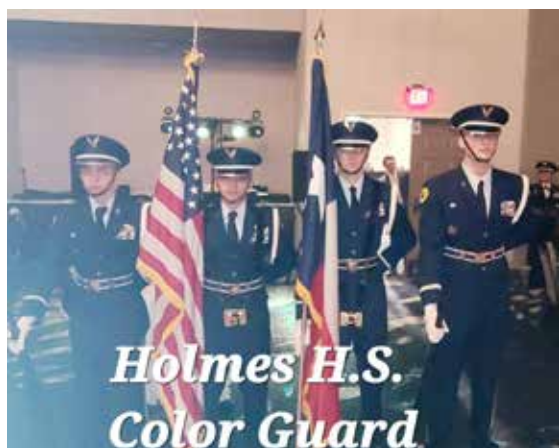
Holmes H.S. Color Guard